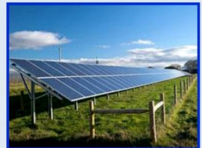
Farm Diversification, Renewable Energy & Feasibility Studies

For more information please contact our team of professionals at your local office: