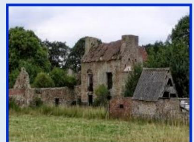
Rural Planning Matters