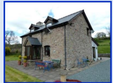
Town & Country Property Rentals