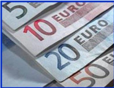
BPS Applications & Entitlement Trading