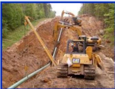
Compulsory Purchase, Land Acquisition and Compensation Matters