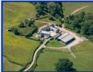
Valuations Including: Secure Lending Probate Expert Witness Inheritance Tax Capital Gains Tax Matrimonial & Partnership Dissolutions Charities Act