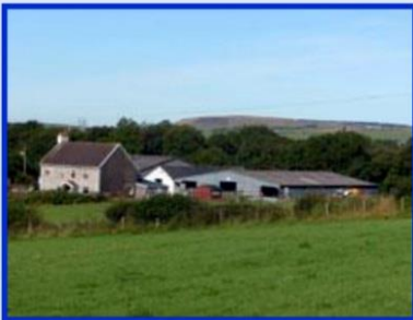
Town & Country Property Sales